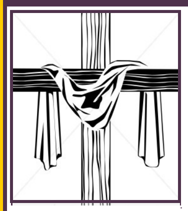
John 3:16 says that God so loved the world that he gave his only begotten son and that whoever believes in him shall never die but have eternal life!