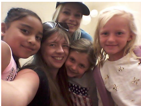
All smiles at JOY Camp