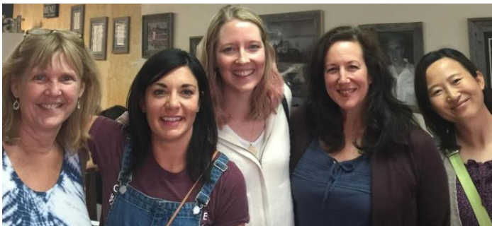
Little Lambs Teachers at the Connections conference in Riverton