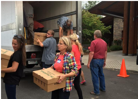
Volunteers unloading the Peach Truck