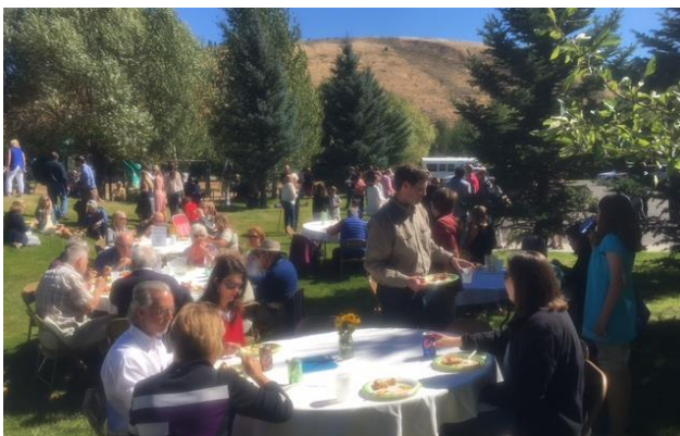
The wonderful All-Church Potluck last Sunday