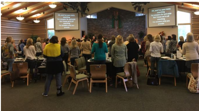
A large gathering of ladies at the Wednesday Mercy study