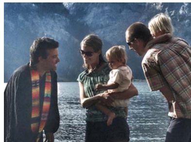
Baptisms last Sunday