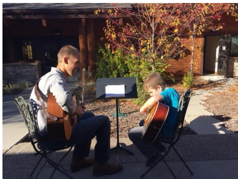
Music Academy Lesson