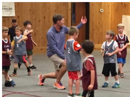
Upward Basketball Game