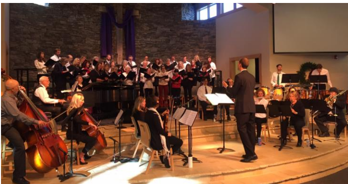
Christmas Cantata Last Sunday