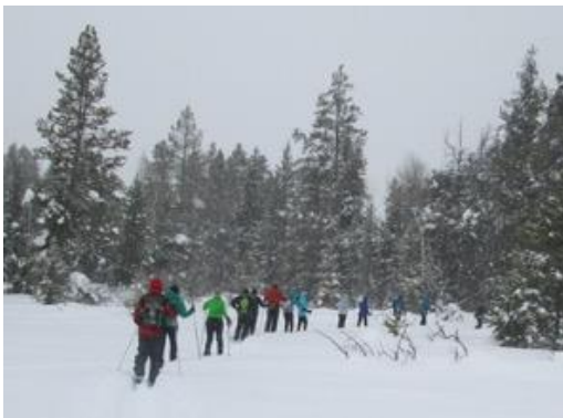
Cross Country Skiing last Sunday