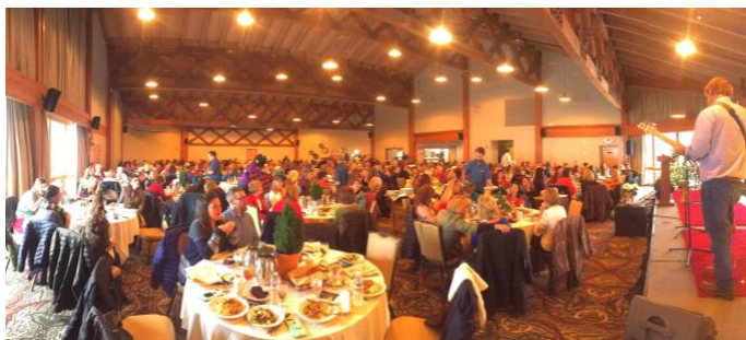
A panorama view of the full house at Snowking for the wonderful celebration at the Women's Christmas Luncheon.