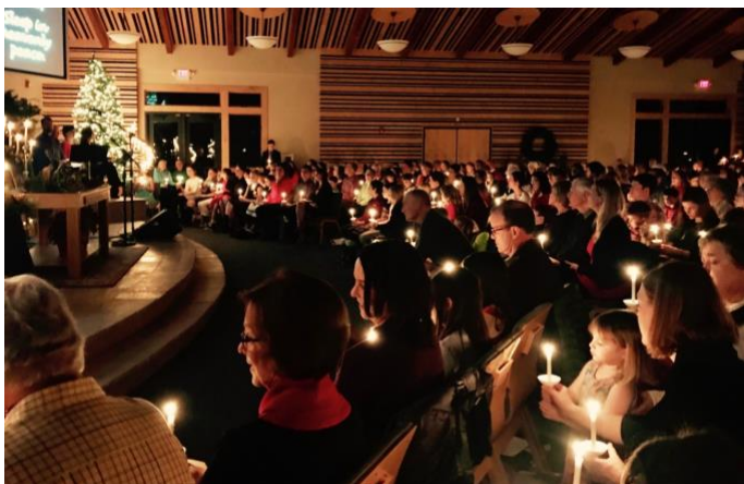
Celebrating Christ's birth by Candlelight at the 5pm service last Sunday!