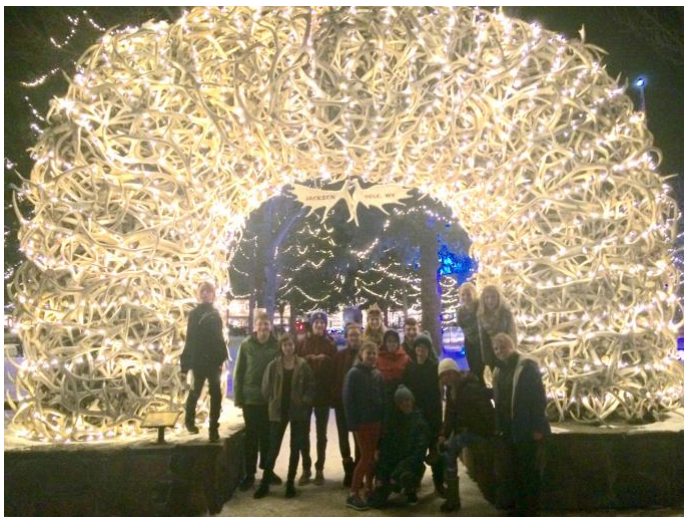
Middle Schoolers pose under Town Square's antler arch before their lock-in on Friday night!