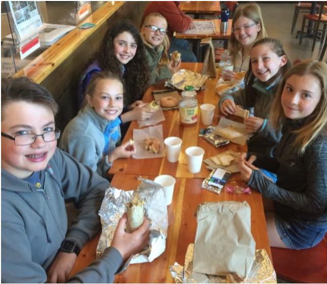
The Breakfast Club crew enjoying a meal out at the Jackson Hole Grocer this week!