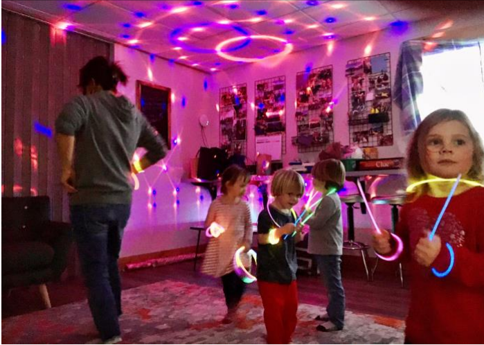
Little Lambs groovin' at their Valentine's Day disco party!