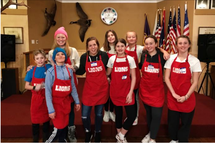
Youth Group serving breakfast at the Elks Club for the Special Olympics this past Thursday!