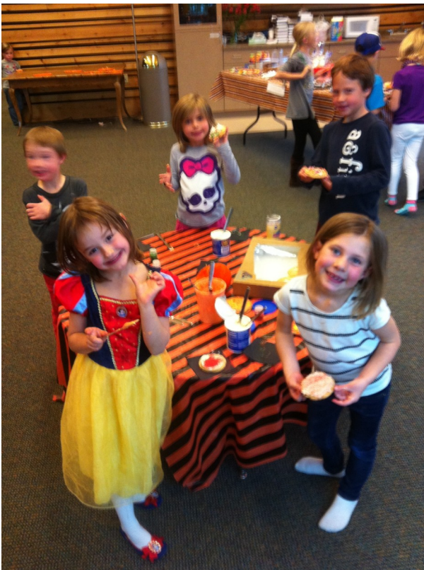
Our Harvest Party