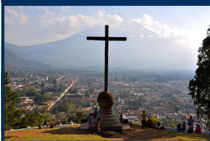
Antigua as viewed from Cerro de la Cruz, 2009

La Antigua Guatemala means the "Old Guatemala" and was the third capital of Guatemala.