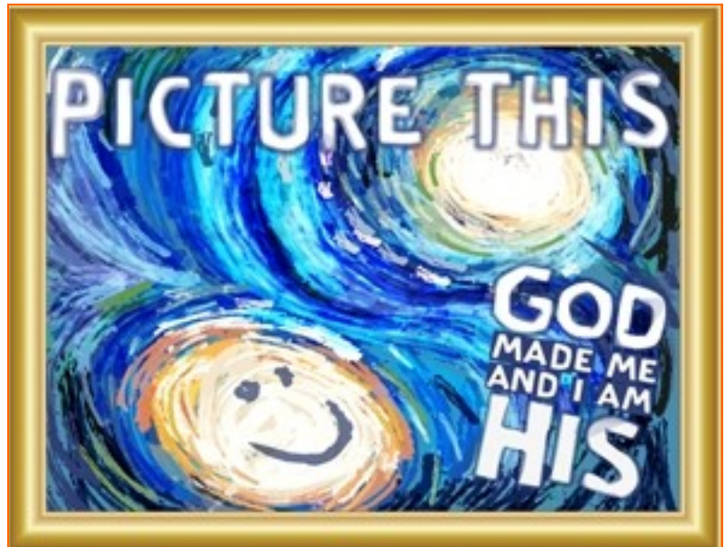
The artwork is from the October 252 Basics, Orange Curriculum by the ReThink Group