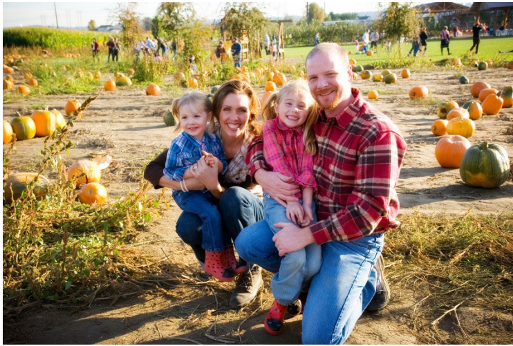
Clip art photo