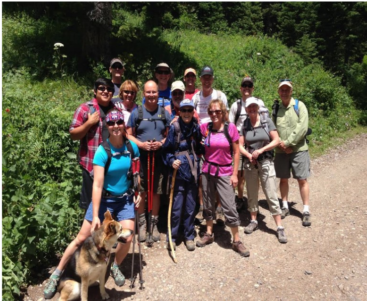
PCJH Sets Off for Ski Lake

going! Every Sunday afternoon we will hike or bike or float. This is a low-key, let's get together and enjoy a summer afternoon sort of adventure. The objective is mostly to share a great afternoon together in this beautiful place than to make miles or summits. There is no target age group, in fact it is hoped to be an inter-generational gathering. All outings will meet at 12:30 p.m. at PCJH to carpool or at 1 p.m. at the starting points listed below: