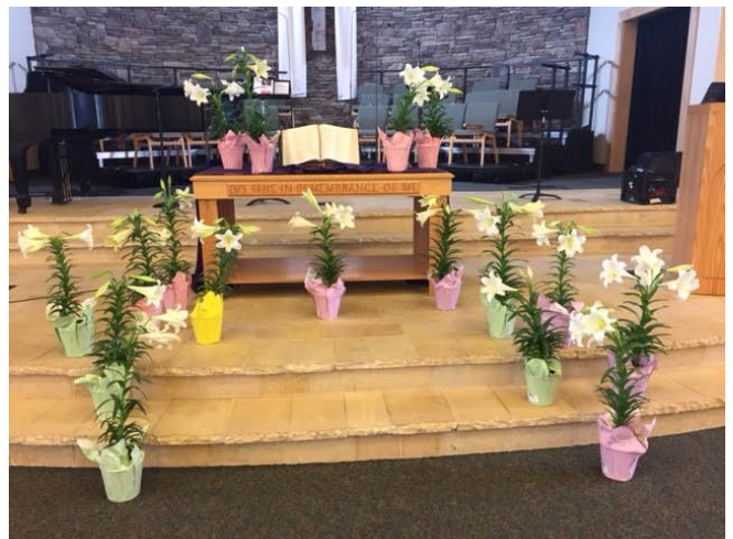
It has been a blessed Easter season here at PCJH