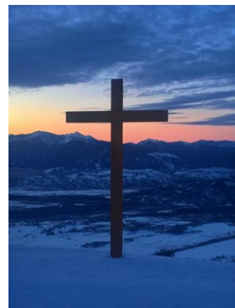
Easter Sunrise Service at the summit of the Gondola