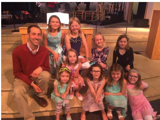
Behold, children are a heritage from the LORD - Psalm 127:3-5