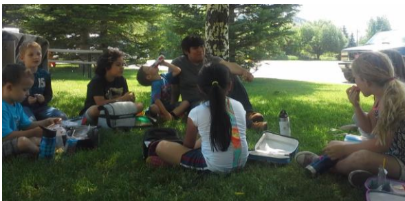
JOY camp is off to a great start!