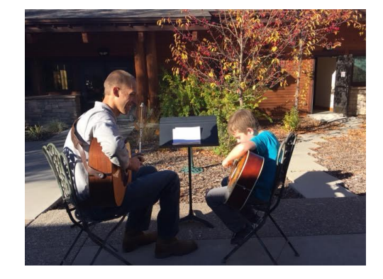
Music Academy Lesson