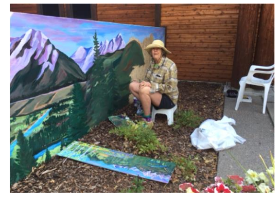
The mural in the courtyard is now complete! Thank you June Nystrom