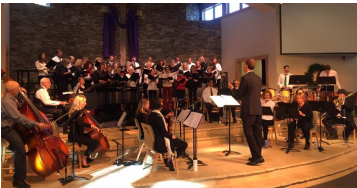
Christmas Cantata Last Sunday