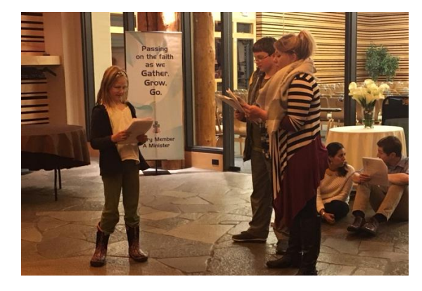
Christmas Pageant Rehearsal