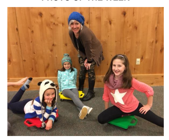
JOY After School is back!