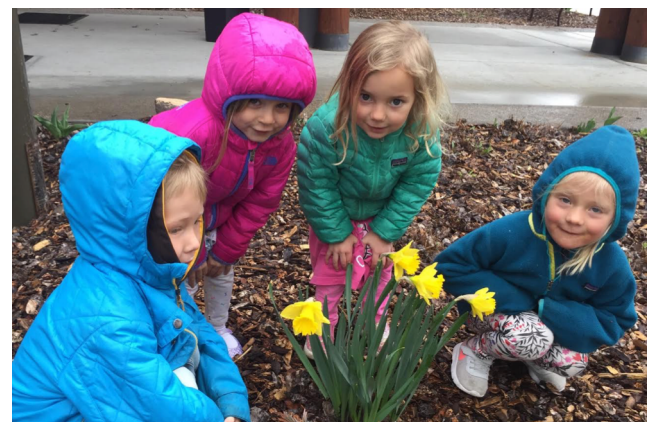
PHOTO OF THE WEEK Little Lambs are still bundled up, but looking to spring!