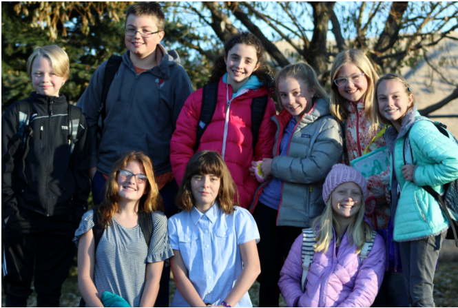
Middle School Breakfast Club huddles for a quick photo on their way to school.