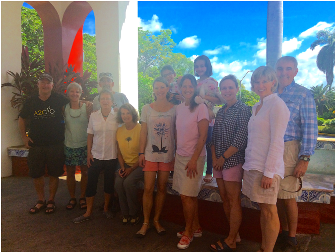
Our Agros Nicaragua mission team pauses for a photo on their way to the village of Tierra Nueva this past week.