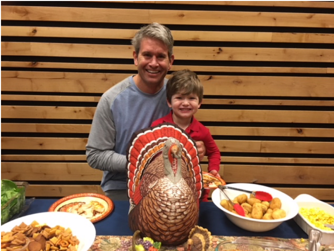
Little Lambs and families celebrated a Thanksgiving feast this past week.