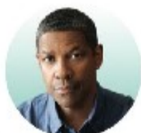
Denzel Washington Actor, Director, Producer, Multiple Academy Award Winner