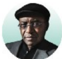
Strive Masiyiwa Founder & Chairman, Econet Group; Philanthropist