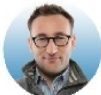
Simon Sinek New York Times Best-selling Author; Optimist