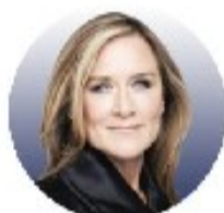
Angela Ahrendts Senior Vice President of Retail, Apple