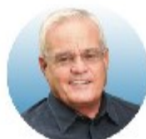
Bill Hybels Founder & Senior Pastor, Willow Creek Community Church