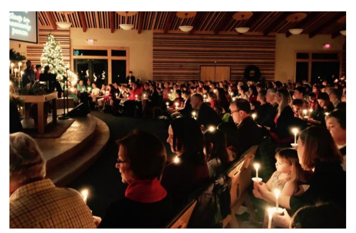
Celebrating Christ's birth by Candlelight at the 5pm service last Sunday!