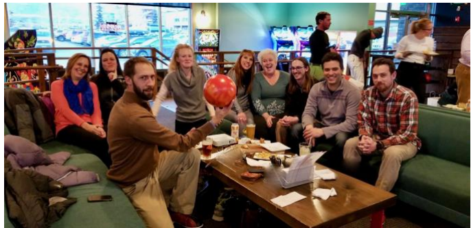
PCJH staff enjoyed a little friendly competition and bonding at Hole Bowl last week!