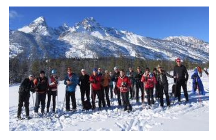
The XC Ski Group enjoying last Sunday's Cottonwood Creek outing. Meet today at 1:30pm in the Home Ranch Parking Lot for a Two Oceans Ski.