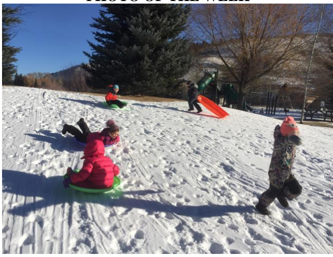
Little Lambs get outside and enjoy the snow this past week, welcome back!