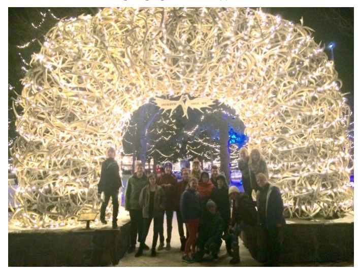
Middle Schoolers pose under Town Square's antler arch before their lock-in on Friday night!