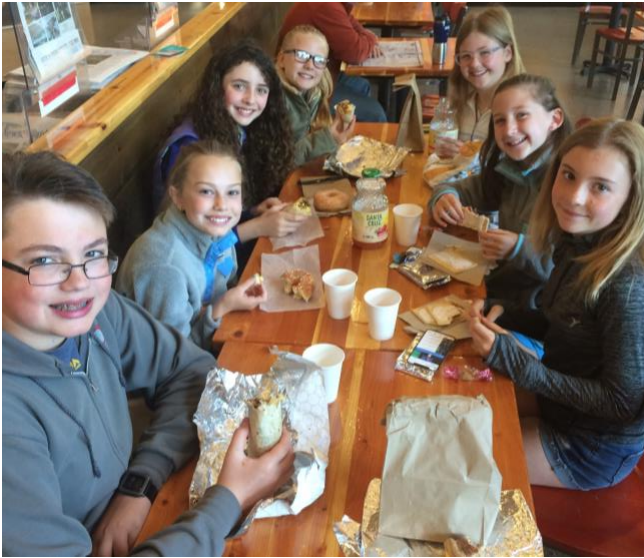
The Breakfast Club crew enjoying a meal out at the Jackson Hole Grocer this week!