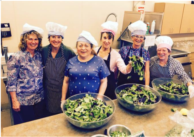
The Wednesday community dinner kitchen volunteers are all smiles, taking a moment to pose in their toques.